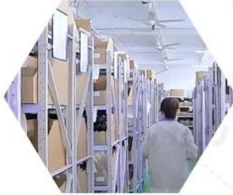
Warehouse spare parts