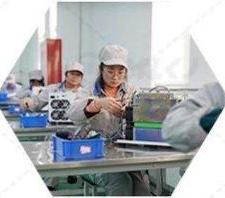
Quality inspection of finished products