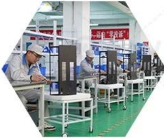
Product assembly process