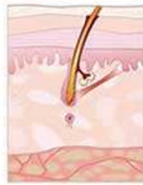
Resting phase (1-2 weeks)