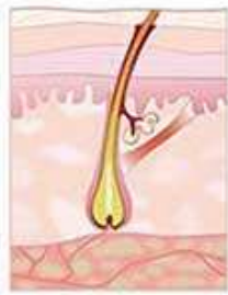
Hair active growth phase(3-6years)