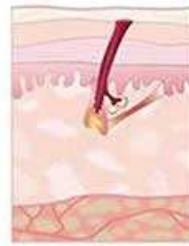
Return to growth phase