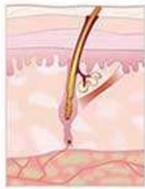
Transition phase (1-2weeks)