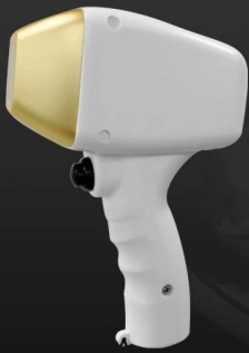
Diode laser handle