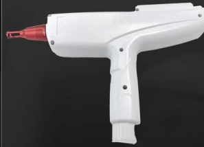
ND YAG Laser handle