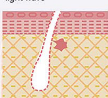
So reach hair removal effect