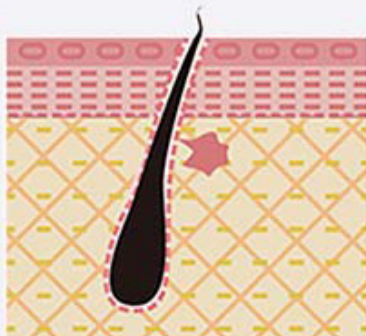
After absorption, the laser energy will be converted into heat energy