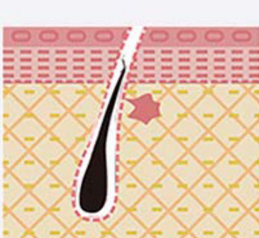
Hair follicles and surrounding stem cells lose their activity and fall off