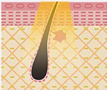
Emit a laser beam

Alma soprano xl titanium Diode laser hair removal comes with 808nm wavelength laser stack or 755+808+1064 triple wavelength laser stack with semiconductors technology. They are assembled together to produce light for permanent hair removal/hair reduction/depilation/epilation treatment!