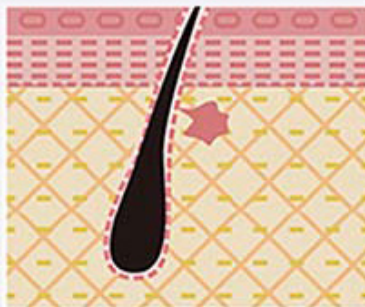
The laser beam is absorbed by hair follicle melanin