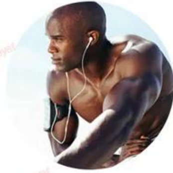
YAG 1064nm For black skin (black hair removal)