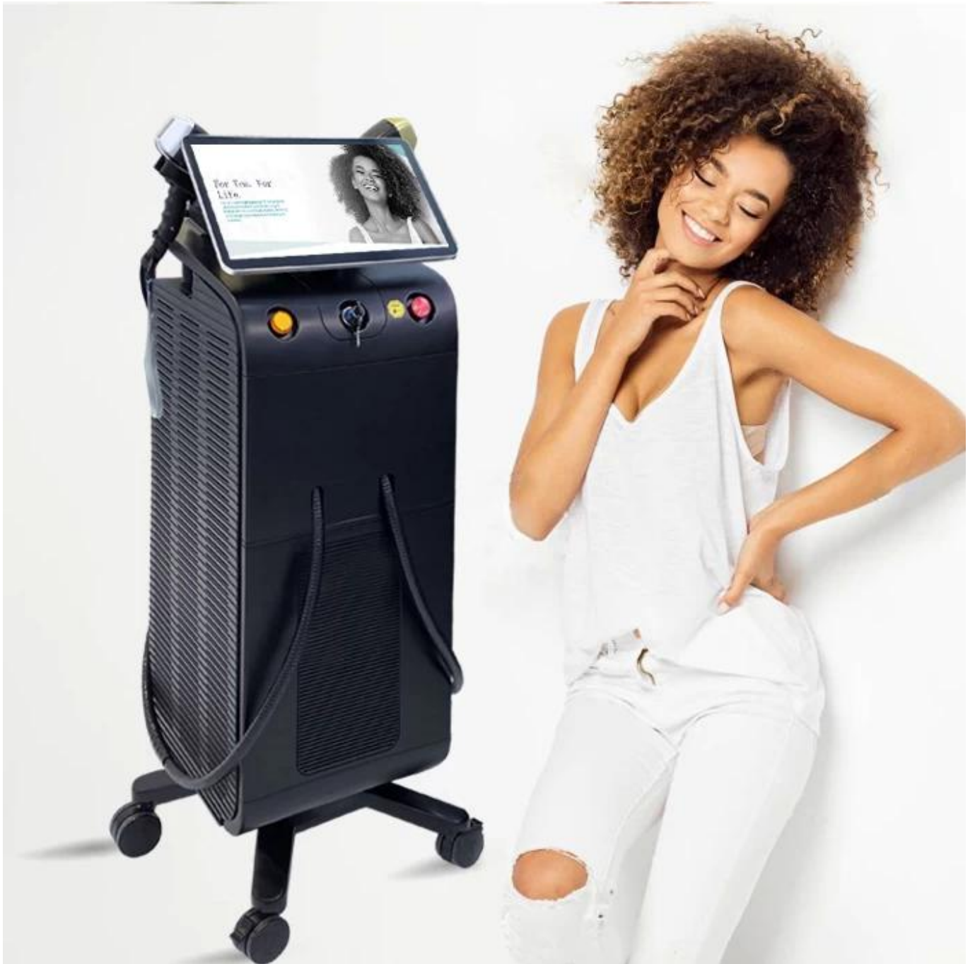
Air + water + compressor refrigeration Ice sensation treatment, comfortable and painless