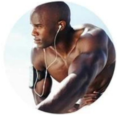
YAG 1064nm For black skin (black hair removal)