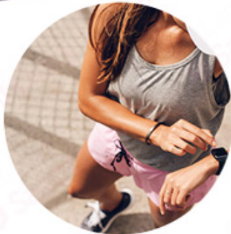
SPEED 810nm For yellow neutral skin (brown hair removal)