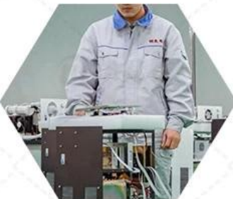
Quality inspection of finished products