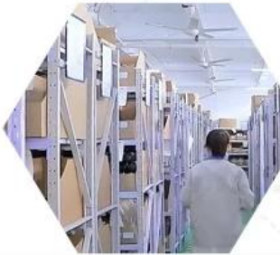
Warehouse spare parts