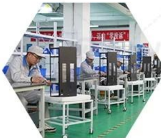
Product assembly process