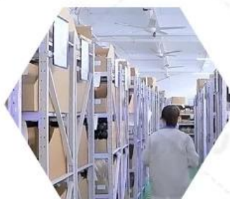
Warehouse spare parts