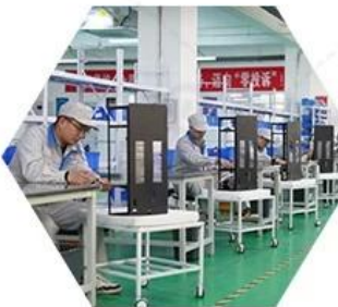
Product assembly process