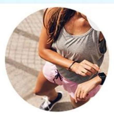
SPEED 810nm For yellow neutral skin (brown hair removal)