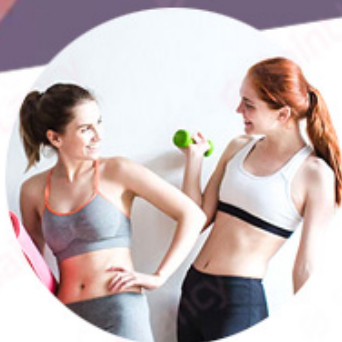
ALEX 755nm For white skin (fine, golden hair removal )