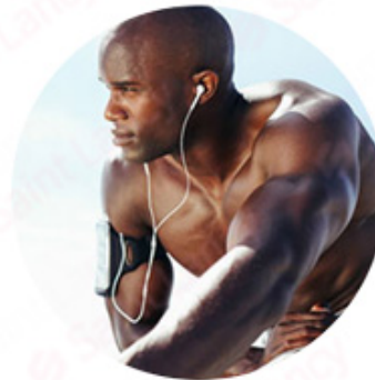
YAG 1064nm For black skin (black hair removal)