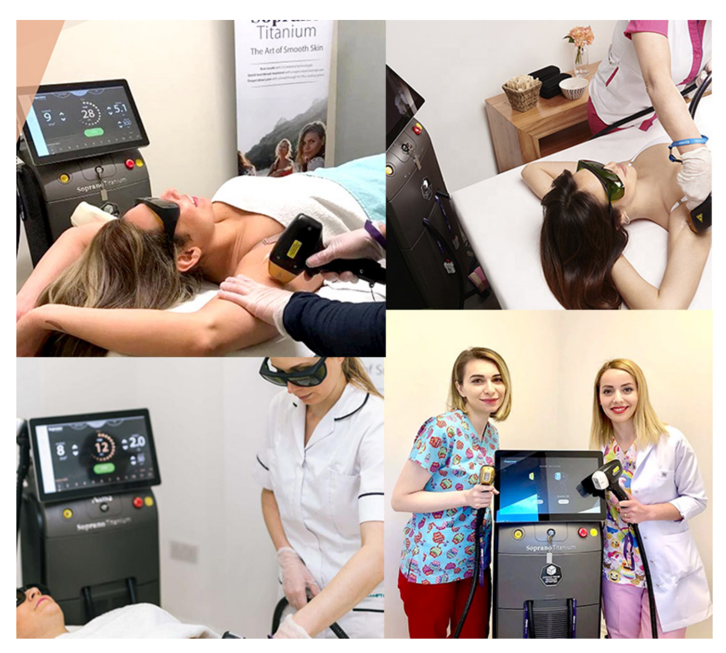
Triple wavelength included:755nm 808nm 1064nm

755nm suitable for light skin hair removal . 808nm suitable for neutral skin hair removal . 1064nm suitable for black skin hair removal .