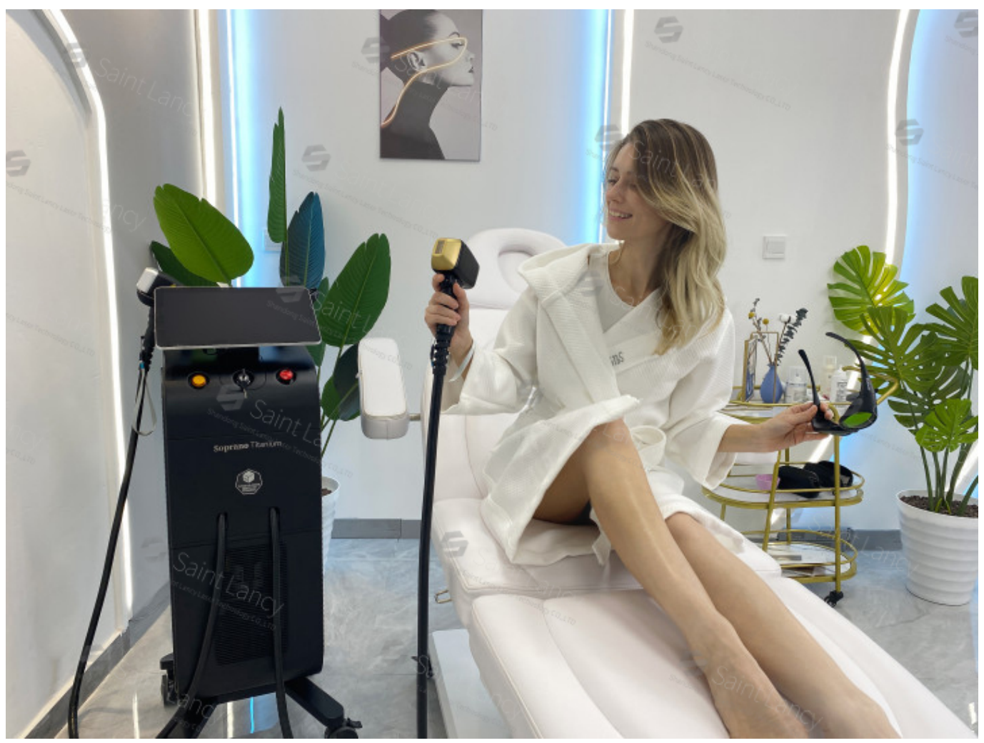
Air + water + compressor refrigeration Ice sensation treatment, comfortable and painless