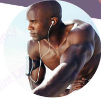
YAG 1064nm For black skin (black hair removal)