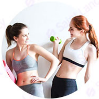
ALEX 755nm For white skin (fine, golden hair removal )