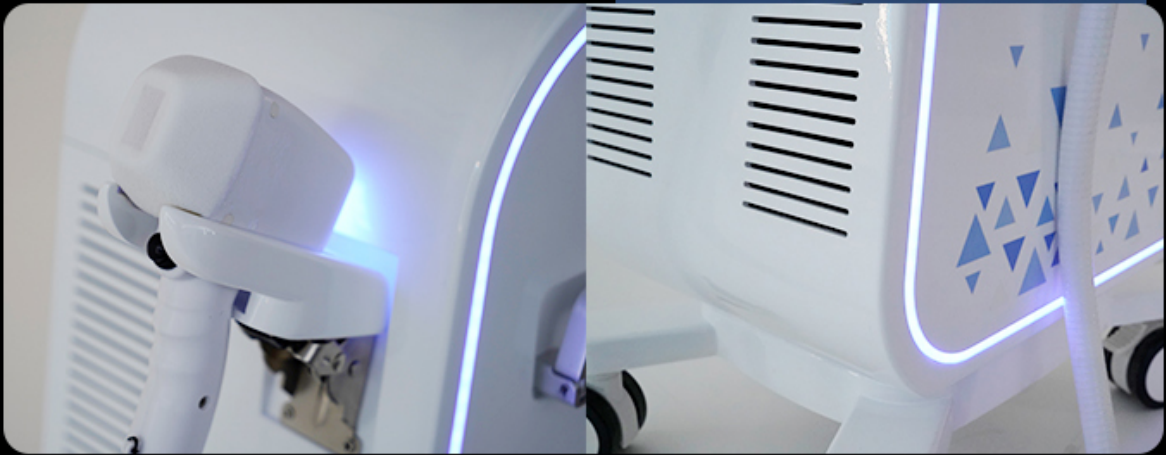
New type EXFU diode laser hair removal machine