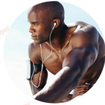
YAG 1064nm For black skin (black hair removal)