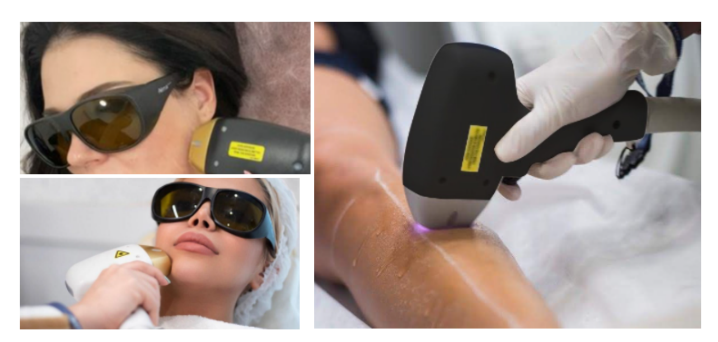
1. Professional. we have more than 15 years experiences in the High-end beauty machine area.