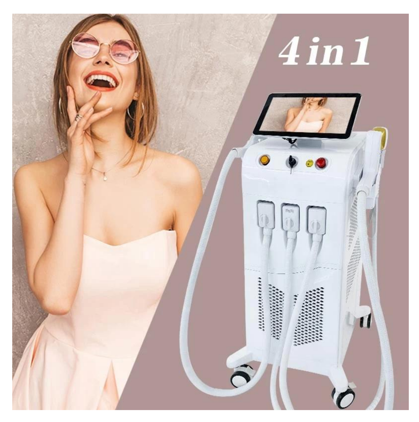
MLKJ\ cost\text{-effective 4in1 multifunction laser beauty machine diode\ Laser+ipl\ laser+nd\ yag\ laser+rf\ laser}