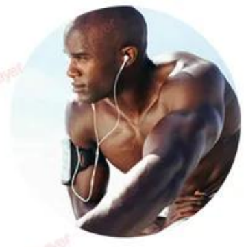
YAG 1064nm For black skin (black hair removal)