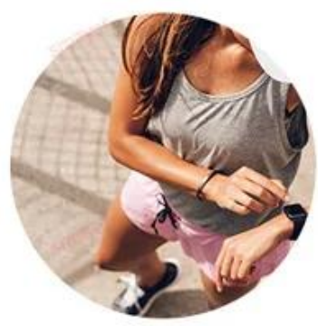
SPEED 810nm For yellow neutral skin (brown hair removal)