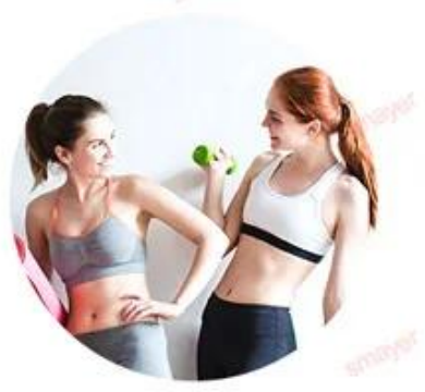
ALEX 755nm For white skin (fine, golden hair removal )