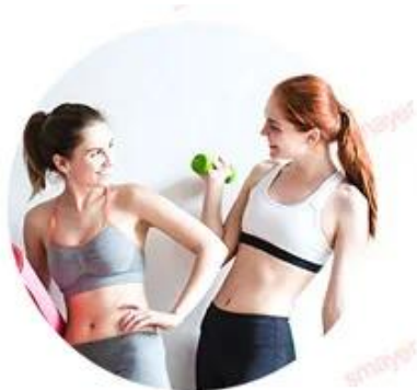
ALEX 755nm For white skin (fine, golden hair removal )