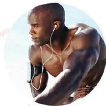
YAG 1064nm For black skin (black hair removal)