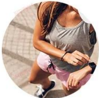
SPEED 810nm For yellow neutral skin (brown hair removal)