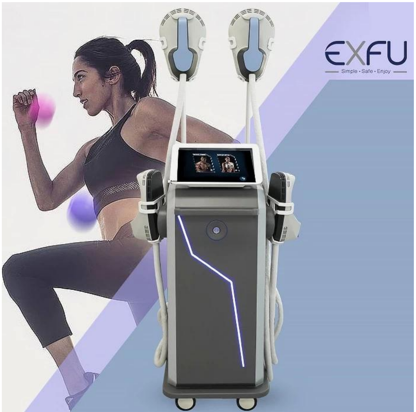
FDA Approved Ems Sculpting Machine 5 in 1 ems sculpt body slimming muscle stimulator machine

We also provide professional custom service, if you need specific language and operation technology, you can also contact us directly.