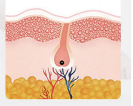
Hair removal also stimulates collagen regeneration, shrinks pores and makes skin firm and smooth

The laser contains four wavelengths output, has a wide range of applicability. It has a certain therapeutic effect on removing red