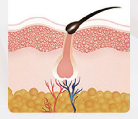
Natural hair loss, prevent regeneration, and achieve the purpose of hair removal