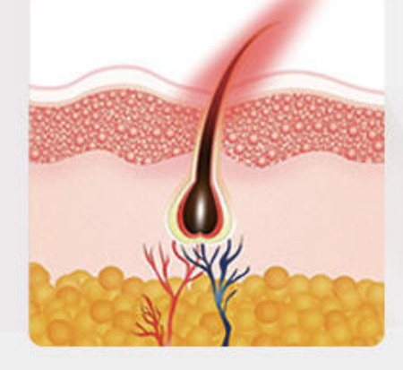
The laser selectively acts on the melanin in the hair follicle, destroying thehair-growing area