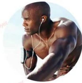
YAG 1064nm For black skin (black hair removal)