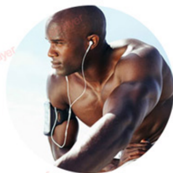
YAG 1064nm For black skin (black hair removal)