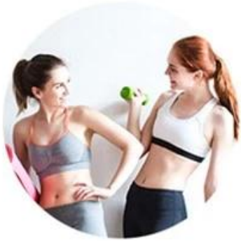
ALEX 755nm For white skin (fine, golden hair removal )

755+808+1064nm, suitable for permanent hair removal of all skin types