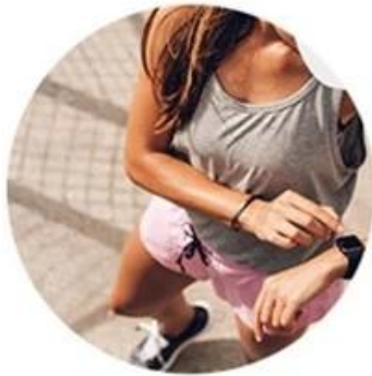
SPEED 810nm For yellow neutral skin (brown hair removal)