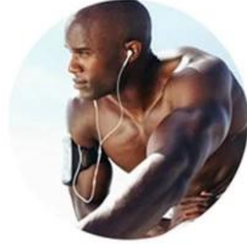
YAG 1064nm For black skin (black hair removal)