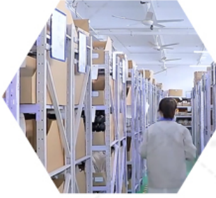
Warehouse spare parts