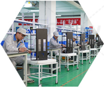
Product assembly process