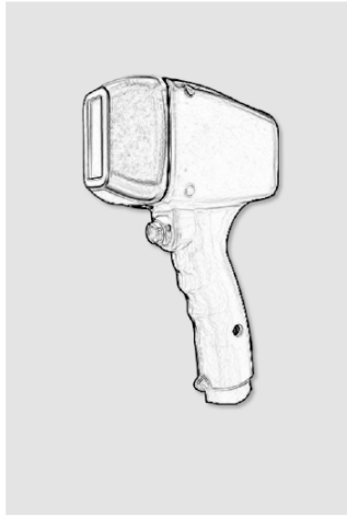
■ spot size:12*36