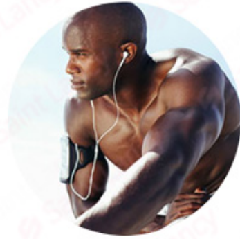
YAG 1064nm For black skin (black hair removal)