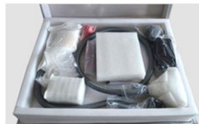
strong and beautiful aluminum alloy case