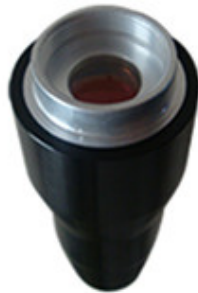
Black doll 1320nm