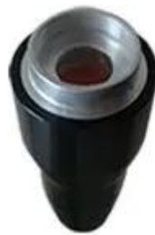
Black doll 1320nm