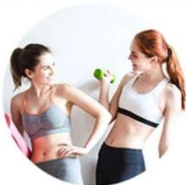
ALEX 755nm For white skin (fine, golden hair removal )

755nm and 808nm and 1064nm , suits for all skin and hair types.