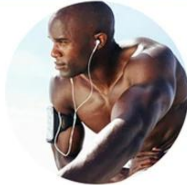
YAG 1064nm For black skin (black hair removal)